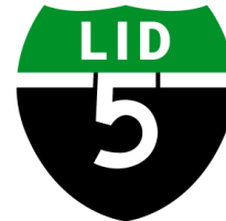
Lid I-5 Seattle, WA