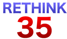
Rethink35 Austin, TX