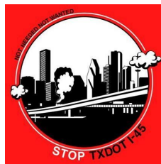
Stop TxDOT I-45 Houston, TX