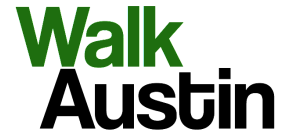
Walk Austin Austin, TX