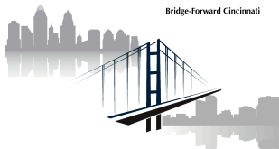
Bridge Forward Cincinnati Cincinnati, OH