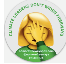
No More Freeways Portland, OR