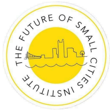
The Future of Small Cities Institute Troy, NY